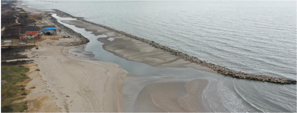
Figure-2 Long Beach Shoreline Protection Project

To the east of Cameron is Vermilion Parish. The Vermilion Parish Police Jury also prioritized getting projects constructed with its GOMESA dollars. Coastal protection projects have been identified as part of its bonding effort.