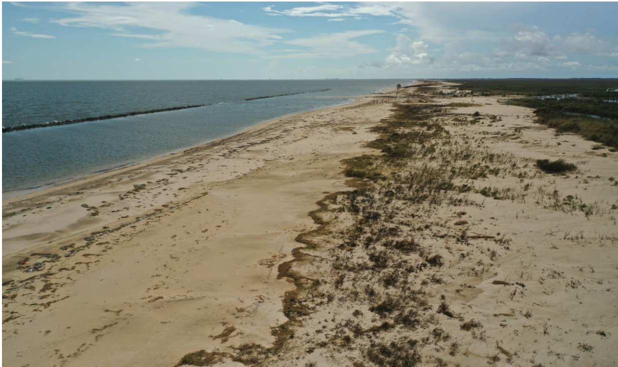
Figure-1 Rutherford Beach Shoreline Protection Project

The Rutherford Beach project was fully funded with Cameron Parish GOMESA dollars. Figure 1 below is a photo of the project post-Hurricanes Laura and Delta. The impacts were from two direct hits by hurricanes of Category 4 and Category 2 strength some six weeks apart. One can only imagine what the shoreline would have resembled had this structural protection not been in place prior to the storm events.