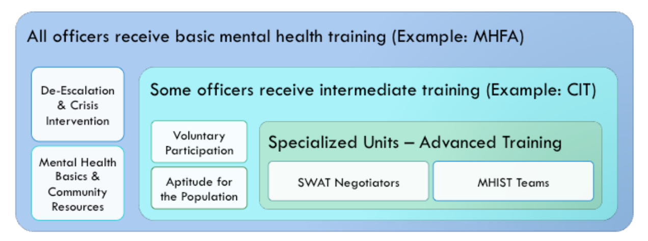
Figure 3: The Tucson MHST Training Model. All officers receive basic training in Mental Health First Aid (MHFA). Select officers receive intermediate Crisis Intervention Training (CIT) and focus on response to behavioral health crises. A specialized MHST team receives advanced training and focuses proactive recognition, investigation, and prevention of potential behavioral health crisis and associated threats to public safety. MHST team members serve as a resource for both CIT and non-CIT officers/deputies in the field who have questions or need help with complex cases. MHST also supports the modern paradigm of community policing [14], as team members forge positive relationships with citizen, advocacy, business, behavioral health, and criminal justice system stakeholders.

takers are CIT trained. MHFA has been incorporated into the training academy so that 100% of each agency receive this foundational mental health training. In addition, MHST serves as a regional training center of excellence, providing training to thirteen urban and rural law enforcement agencies across southern Arizona.